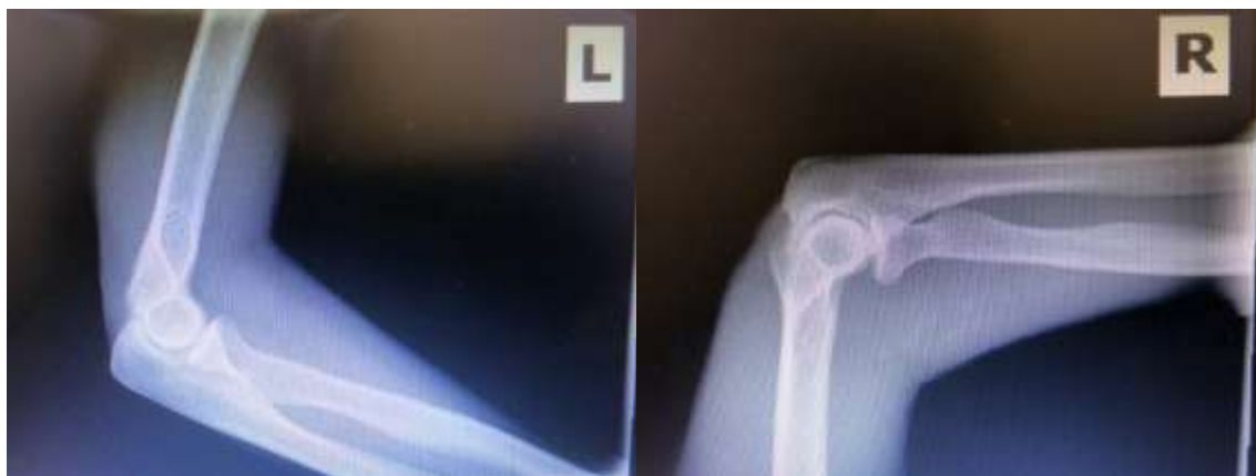
Figure 1: The left elbow radiograph is normal. The right elbow radiograph shows Kellgren-Lawrence Grade 3 Osteoarthritis.

extension and 10° loss of flexion. She had a 10° loss of pronation and supination. There was one plus swelling of the elbow joint. Her radiographs reveal grade four Kellgren-Lawrence osteoarthritis of the elbow joint (Figure 1).